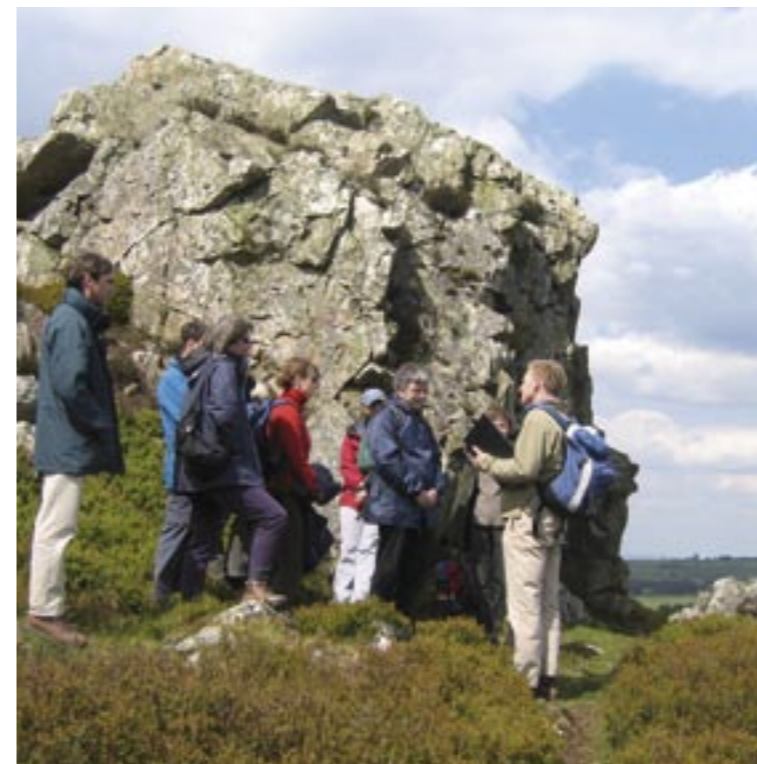
Forum visits Shropshire Hills AONB