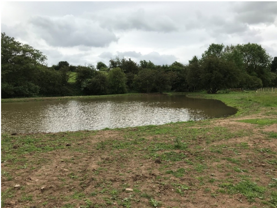
Pool construction at Badger Brook Farm near Longdon (Project CC001)