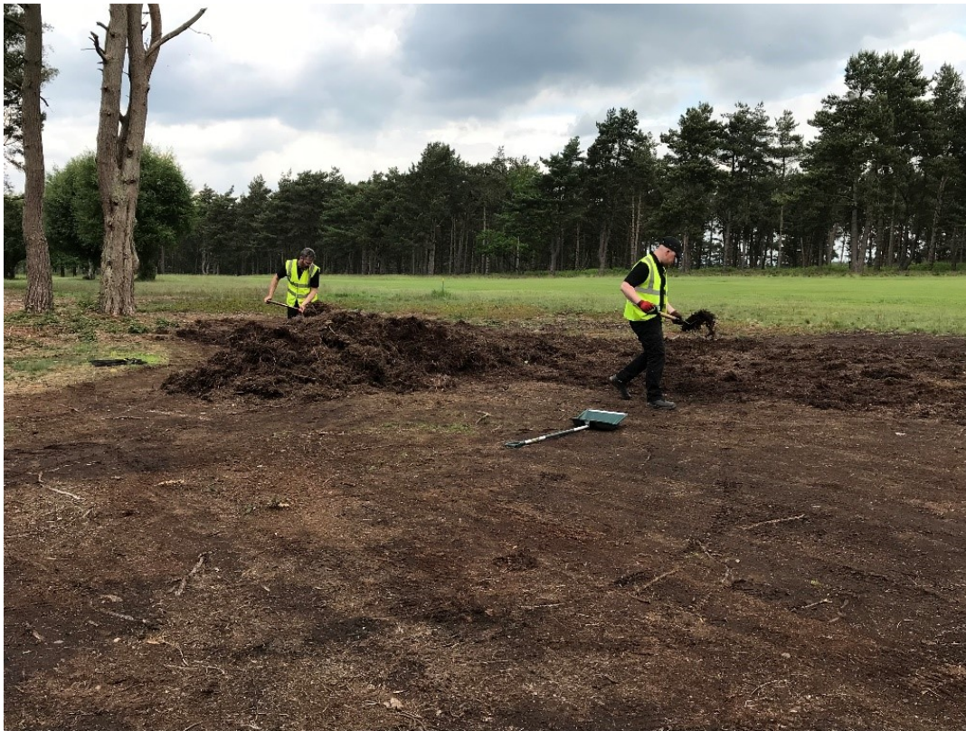
Spreading heather brush at Beau Desert Golf Club (Project CC006)