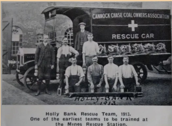
Holly Bank Rescue Team, 1913. One of the earliest teams to be trained at the Mines Rescue Station.

Many interesting families have lived on Cannock Chase over the centuries and not all of them were rich land owners. See if you can find out about some of these other interesting characters: