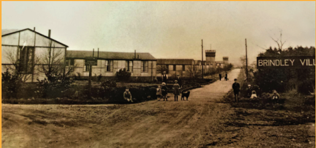
Entrance to Brindley Village, c1928

In 1916, a military hospital was built at Brindley Heath. Hospital staff cared for casualties returning from the trenches as well as troops stationed at the training camps. The hospital closed in 1923. From 1924, miners working at West Cannock Colliery were housed, with their families, in the recently abandoned buildings. ‘Brindley Village’ was born and by 1926 a club and school had been installed, and the hospital chapel re-dedicated as St Mary’s Church. The village thrived until 1955 when the buildings were demolished, but remains may still be found amongst the vegetation. Brindley Village school closed in 1959.