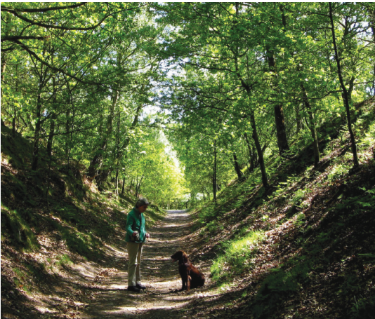
Along the line of the Tackeroo Express

Continue down the track to post (20) and follow the blue waymarkers back to the Visitor Centre.