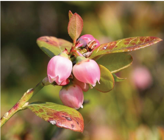
Cannock Chase berry

2 miles (3.2 kilometres) – approx. 2 hours